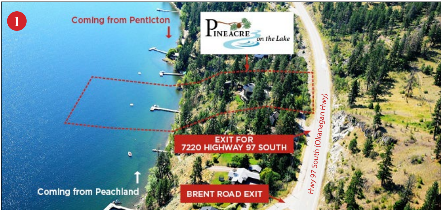
Photo of actual turn-off